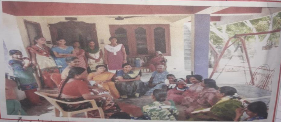
Veppathur village people and Commerce department staff members and students.