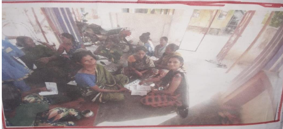
Students assist village people to fill up the Bank challans.